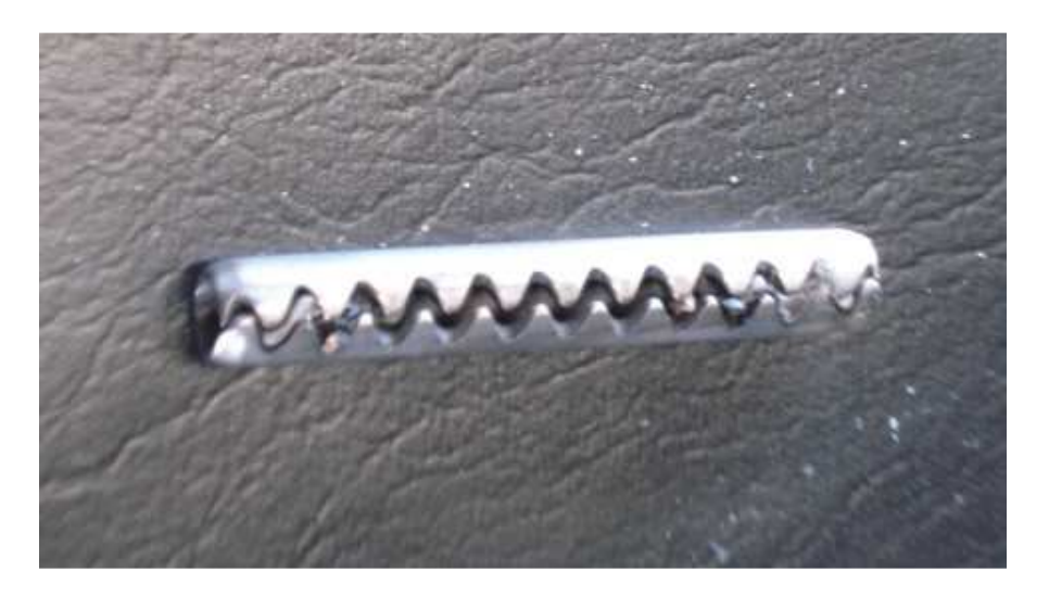
Step 3) Tap the Company23 roll pin tool to install the new axle pin. The pin should be installed flush with the CV axle's outside diameter. Twist the tool as you remove it.