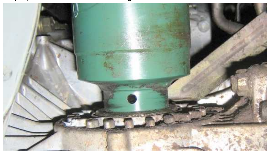
Step 2) Insert the Company23 axle pin tool's small end into the inside of the new roll pin.

Step 1) Install new axle ensuring the holes of the axle match the hole on the stub shaft of the transmission.